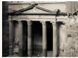
Nabatean temple, Petra, Jordan.

‘The voyage of a thousand miles begins with one step’