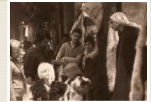
James Madina Souk, Aleppo Syria.