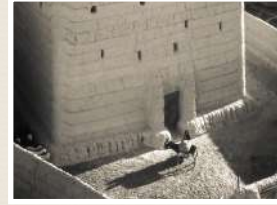
Grain silo, Sana'a, Yemen