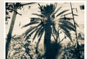
Skoura oasis, southern Atlas, Morocco.