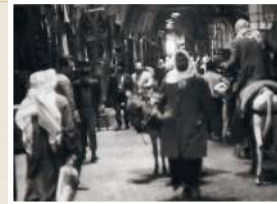
Al-Madina Souk, Aleppo, Syria.