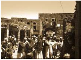
Hamir market, Yemen. Charles Stuart 1976