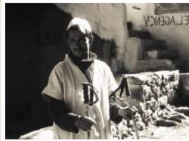
Imllil, High Atlas, Morocco James Stuart 1990