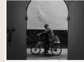
Man on bicycle, Essaouira, Morocco.