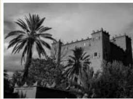
Skoura oasis, southern Atlas, Morocco.