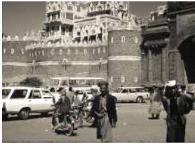
Man & knife, Sana'a, Yemen