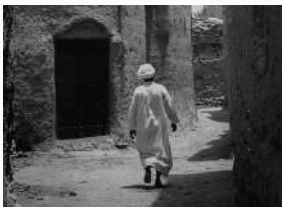
Najran, Saudi Arabia Charles Stuart 1976