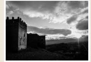
Glaoui Fortress, Telouet, Morocco.