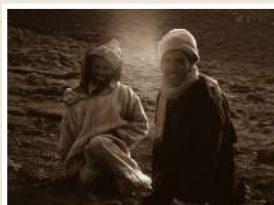
Bwgmez tribesman, M'Goun, Morocco.