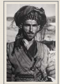
Pizdhar tribesman, Kurdistan