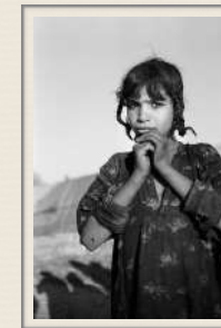
Suaid girl (Marsh Arabs), Iraq

Sir Wilfred Patrick Thesiger (b. Addis Ababa 3 June 1910 - 24 August 2003), was an English explorer and travel writer. Thesiger's travel books include Arabian Sands (1959), on his foot and camel crossing of the Empty Quarter of the Arabian Peninsula, and The Marsh Arabs (1964), on his time living in the marshes of Iraq with the Marsh Arabs. A spirited adventurer, writer and acclaimed photographer he donated his collection of 38,000 photographs to the Pitt Rivers Museum, Oxford from where these prints were purchased for the Califa collection.