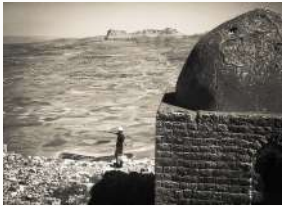
View from Hamir, Yemen Charles Stuart 1975