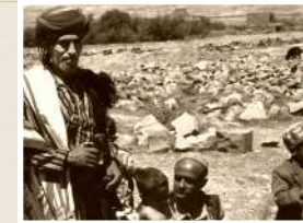
Hamir tribesman, Yemen